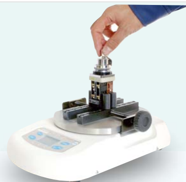
● Key Switch Torque Measurement