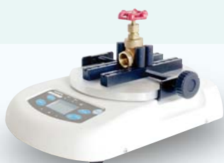
● Valve Opening/Closing Torque Measurement