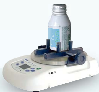
● P.P. Cap Opening. Fitting Force (TNX)

* For Specifications, Please refer Page 8