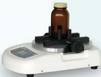
● Screw Cap Opening. Fitting Force.