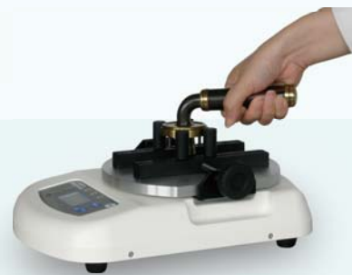
● Torque Measurement of Door Lever