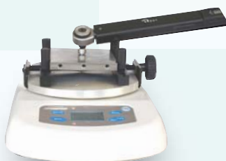
● Test of Torque Wrench