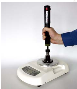
For Torque checking of Torque Driver

300 items data could be memorized with 10 patterns. With statistical function, Data No., Max. Value, Min. Value, Average Value is automatically calculated.