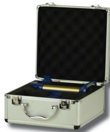
ST-320BL in Included Metal Carrying Case