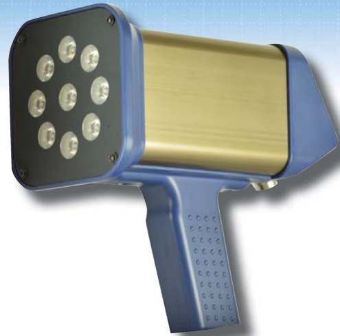
ST-320BL Black Light LED Stroboscope

The ST-320BL is designed for speed and frequency measurements in the printing, packaging, textile, automotive, cable, mining, steel, chemical, optical and medical industries in various applications.