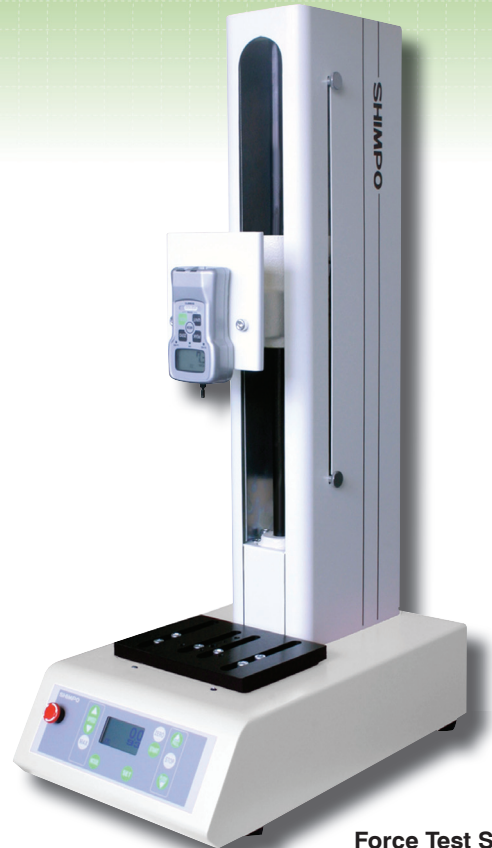
Force Test Stand shown with Force Gauge (Sold Separately)