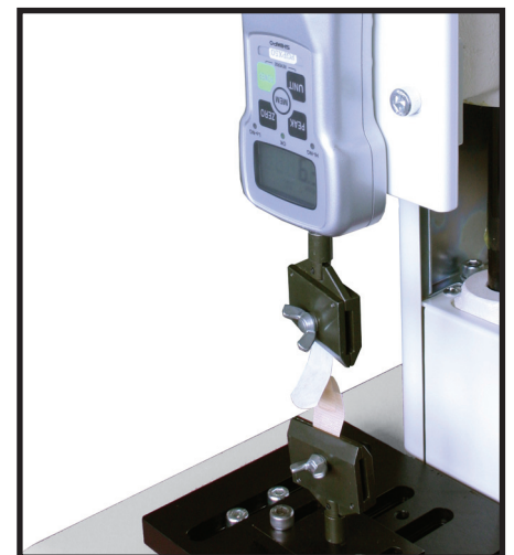
Stand with Optional Grip Performing Peel Test