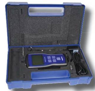
FG-7000 with Accessories in Protective Carrying Case