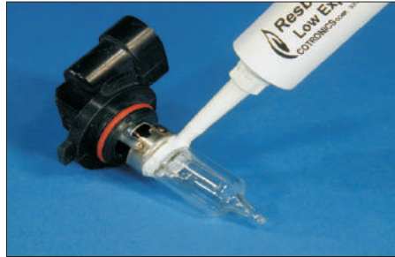
Resbond 940LE Bonds a High Performance Quartz Lamp