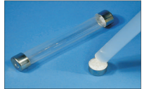
940HT Bonds a Sapphire Tube To a Metal End Cap for Use at 2650°F