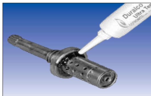
4703 Repairs a Valve Seal