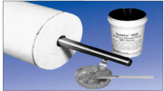
4525 Bonds a 316 S.S. Shaft to a Ceramic Piston Repairing a High Temperature Acid Pump

Quantity Prices & Custom Formulations Available on Request